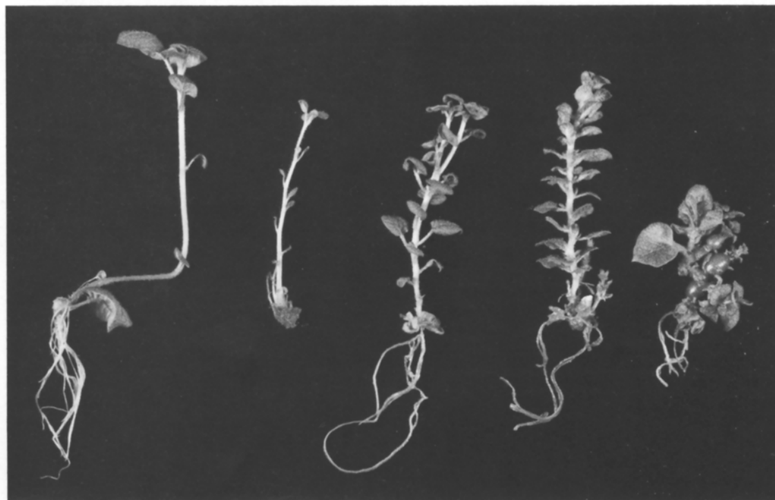
Fig. 1. Single shoots from cv. 'Maris Bard' and potato lines transformed with T-DNA from LBA1834(pRAL1834). From left to right cv. 'Maris Bard', Mb1834A7, Mb1834E4, Mb1834B4 and Mb1834B3

The morphological variation between 'Maris Bard'-derived shoots and the uniformity among 'Desiree'-